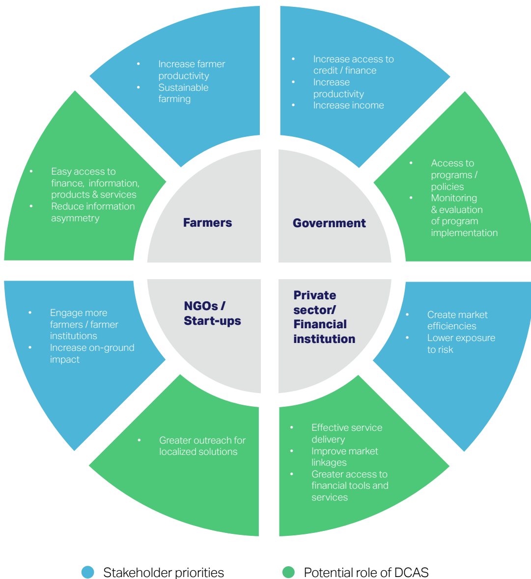
Figure 2: Stakeholder priority mapping in relation to DCAS

The farmer interactions with the application are constantly monitored and the application is adjusted to ensure it is easy to use. The application has been a big hit among farmers in North India and Maharashtra and has ensured encouraging cost savings for them. The company has a mission of touching the lives of 100 million dairy farmers in the country and making them prosperous.