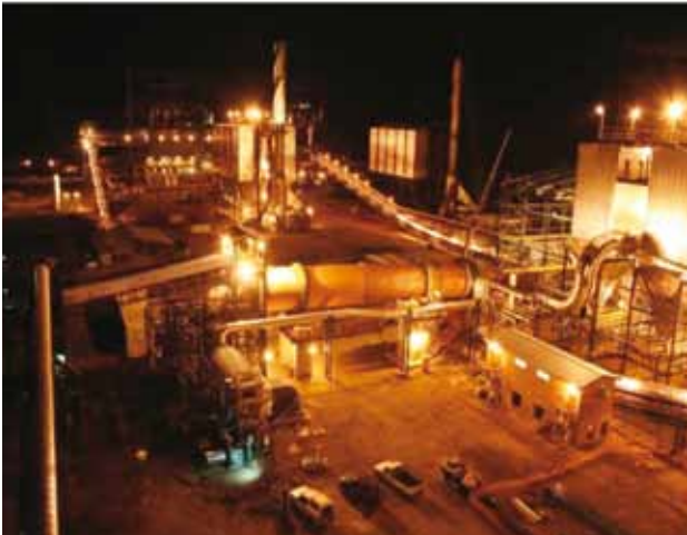
Lion Ferrochrome Plant in Limpopo

An international mining group, Xstrata is committed to achieving energy efficiency at all its operations. This is an approach that is typified by the award-winning programmes it has undertaken at its venture with Merafe in South Africa, where it has achieved a significant saving of more than 12% per tonne of alloy produced.