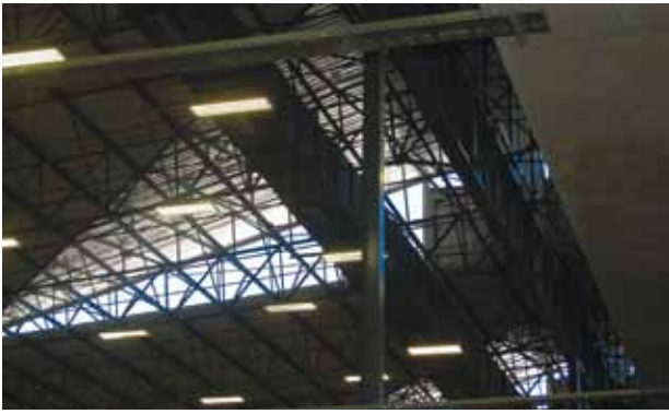
Roof design provides natural lighting

Fans have carbon dioxide detection meters that automatically turn air extraction on when the CO 2 emissions reach a pre-determined level. The fans and air conditioning plant are driven by ABB variable speed drives that use energy more efficiently and pick up speed in a slow controlled manner which eliminates high power demand bursts at start-up.