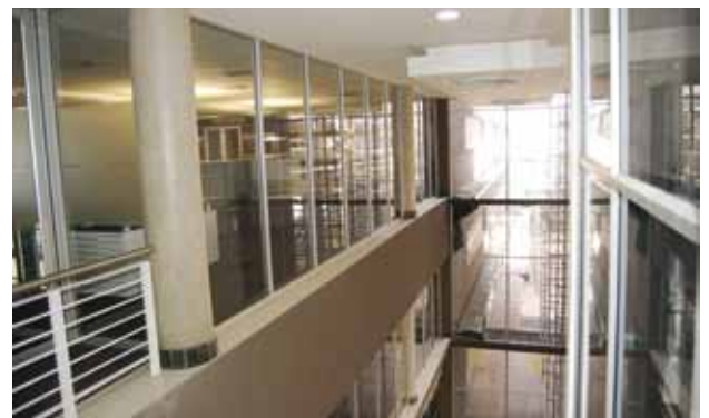
Mix of low energy and natural lighting