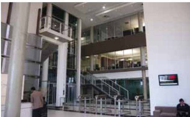
ABB South Africa has also won a top energy efficiency performer award in the industrial category of the eta Awards sponsored by energy utility Eskom for its Longmeadow building.

ABB's Longmeadow green office building and factory was the venue for Automation and Power World Africa on 11 and 12 November 2009 – the company's largest customer event in Africa. The new facility was officially opened by ABB Group CEO Joe Hogan as part of the proceedings.