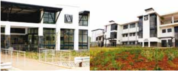
Woolworths Midrand Distribution Centre.

This strategy involves a multifaceted plan that incorporates a series of challenging targets and commitments, centred on four key priorities: accelerating transformation, driving social development, enhancing environmental focus, and addressing climate change.