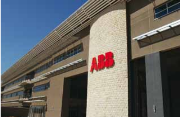
ABB's Longmeadow Head Office

ABB's Longmeadow head office, manufacturing and logistics centre has been designed with an impressive depth of research and focus on design, construction and facilities management automation, resource efficiency, recycling and ongoing minimal environmental impact. This has ensured that the site is a shining example of ABB's environmental best practice.