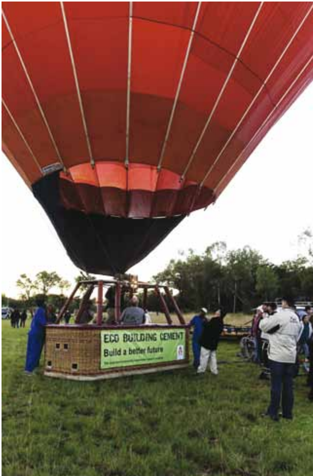
Awareness creation of the Eco Building Cement

It has been shown that bucket elevators draw on average 0,41kWh/t of material, while air lifts draw 1,10kWh/t of raw material (World Cement, 2004). The 2003-2004 upgrade of the Duffield 3 raw meal elevator and the subsequent 2006 upgrade of the Duffield 2 elevator from air lifts to bucket elevators therefore resulted in a 62% reduction of electrical energy use.