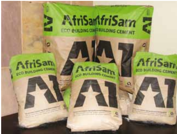
Eco Building Cement

AfriSam has been at the forefront of energy efficiency initiatives for many years – an effort recognised at the eta Awards 2008, when AfriSam was named ‘Top Energy Efficiency Accord Performer’ in the industrial category. Using 2000 as its base year, AfriSam has reduced its specific electrical energy consumption by 25% and its specific thermal energy consumption by 40%.