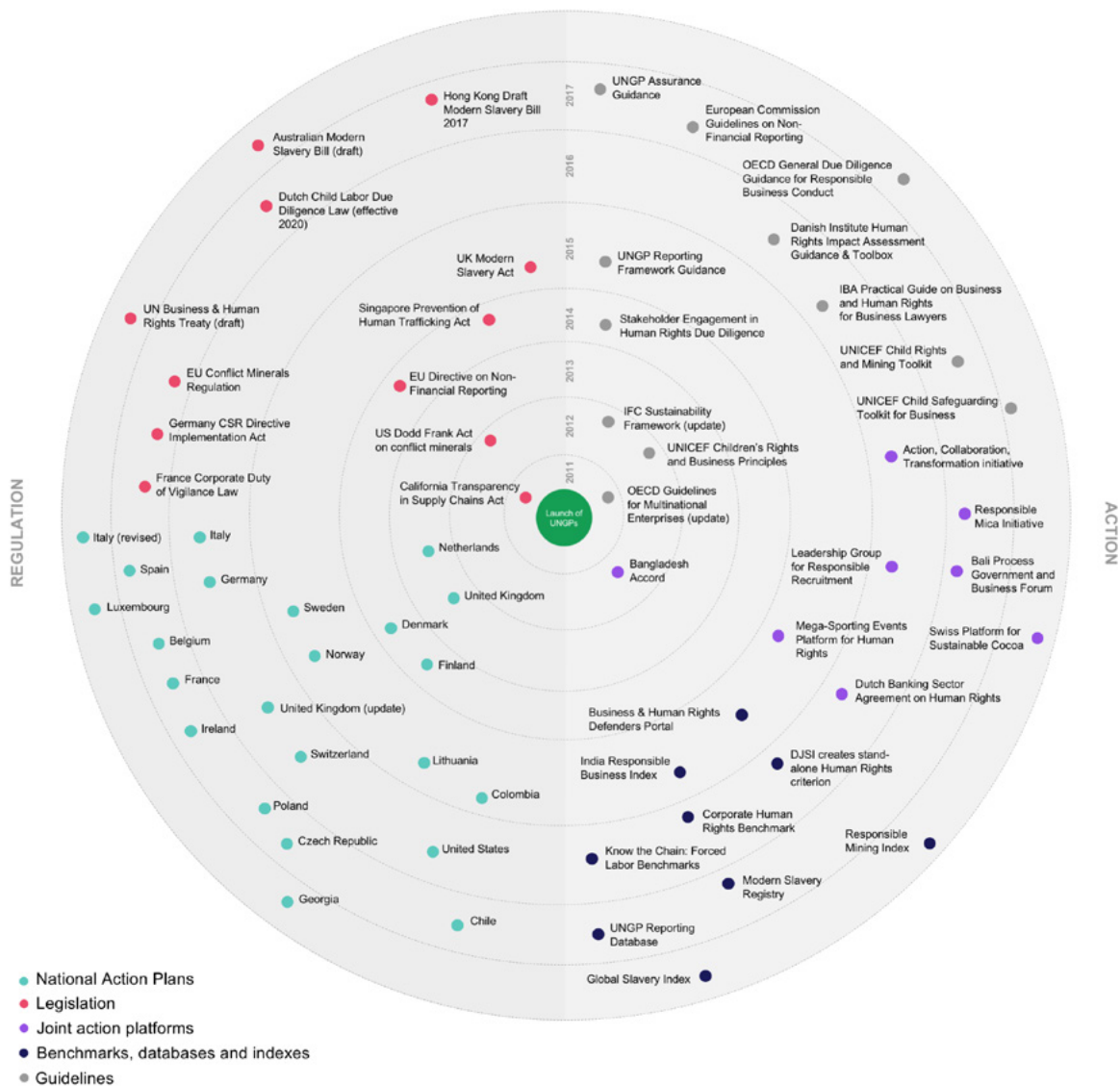
Figure 1. Notable landmarks across the business and human rights landscape 2011-2018. Includes both regulatory developments and key actions taken by business, NGOs and other stakeholders to advance the business and human rights agenda.

The cumulative effect of this evolving regulatory environment, coupled with enhanced scrutiny and evaluation of business performance, are continuing to make human rights a field in which companies have mounting motivation and interest to take meaningful action. Meanwhile, the increasingly widespread