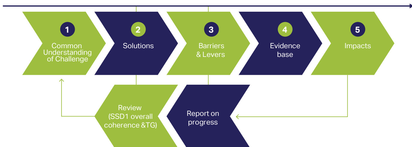
Figure 1. Critical path for solution development

To facilitate thinking through generalized impacts of solutions, FReSH asked participants to consider impacts on social, environmental, and health dimensions, and to test the business case for the solutions.